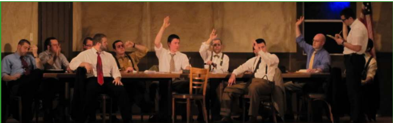
The full jury takes a vote in regards to the innocence of the defendant. The debate continues after the vote.

I think I speak for everyone as we anxiously await what the performance will be next year? Tickets are already being reserved for the Holy Father to attend!